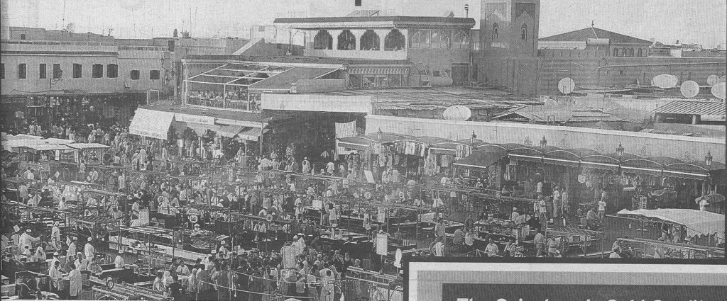
HUSTLE AND BUSTLE: The market stalls in Djemaa El Fna where you can buy local food or watch the entertainment