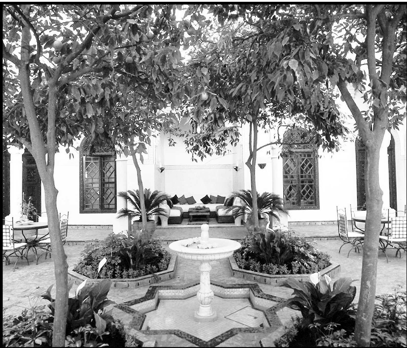
HEAVEN SCENT At the Villa des Orangers, the entrance is lined with candles and after dark the courtyard is ringed with dozens of flickering nightlights, making it one of the most romantic riads in Marrakesh