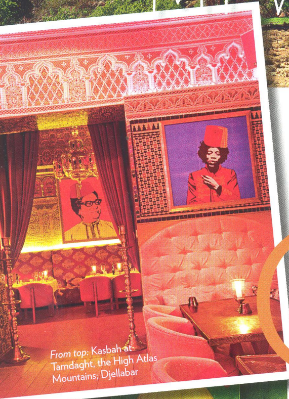
From top: Kasbah at Tamdaght, the High Atlas Mountains; Djellabar